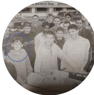
Chenove Aeromodel Club - 1998