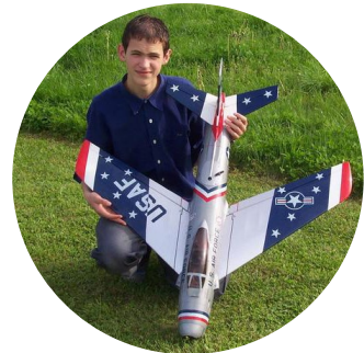
Chenove Aeromodel Airfield - 2004